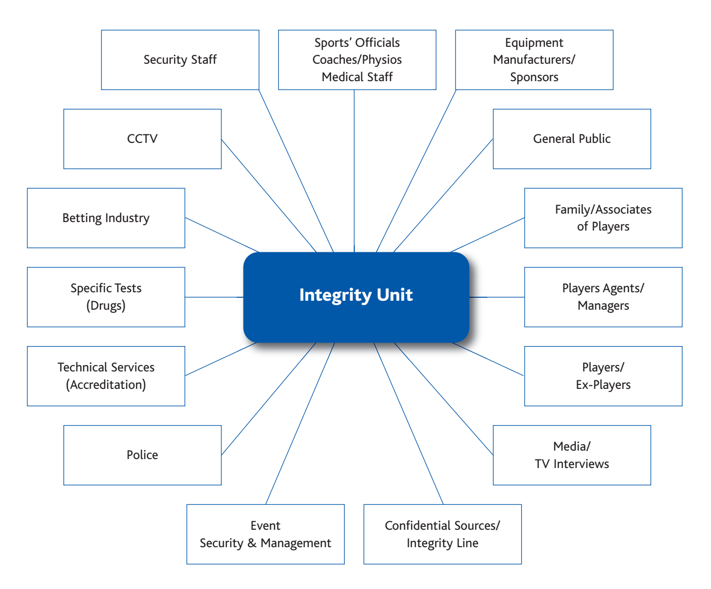
Figure 1: POTENTIAL INTELLIGENCE SOURCES

Crucial to the success of the Unit will be a "fit for purpose" computerised system but the minimum constituent elements should include: